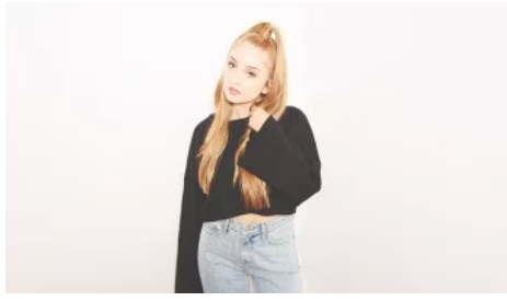
Disco Fries Remix Harlee "Venom"