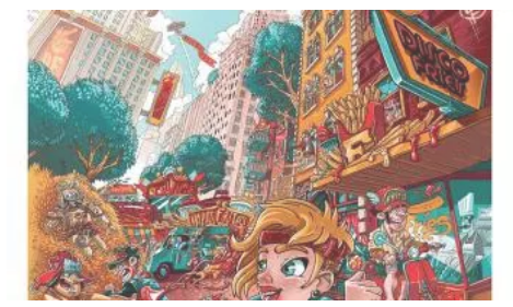
Disco Fries Bring 2017 to a Close With Jazzy New 'DF' EP