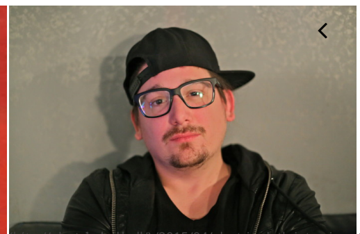
ELECTRIC SLOTH INTERVIEW: RAIN MAN - WEBSTER HALL