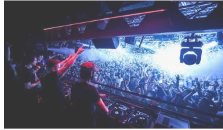
Cosmic Gate Talks Miami Music Week 2017: The Nocturnal Times Exclusive Interview