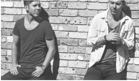
The Nocturnal Times Exclusive Interview: Gemellini