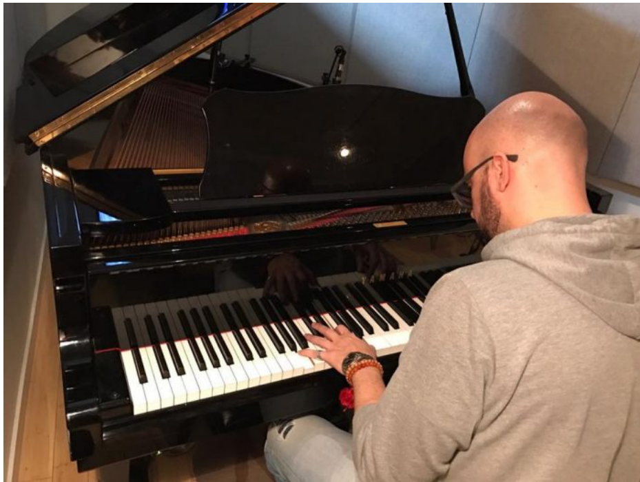
Spanish DJ UNER sits down for an exclusive interview with thatDROP