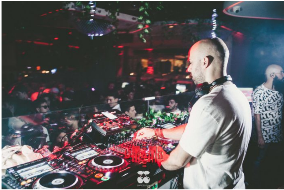
New party brand in EDM Industry: Umamii