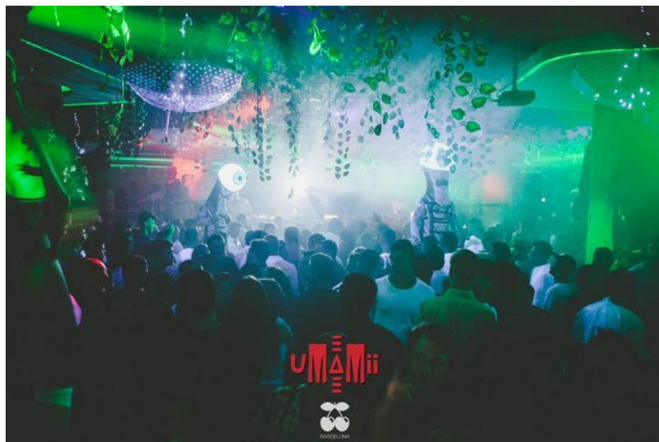
New party brand in EDM Industry: Umamii

Rumor has it that you are working on a new album right now in the USA with some classical musicians and composers in their studios. How is the progression of the album coming along and are there any artists you are stoked about working with?