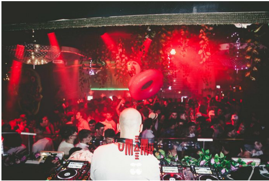
New party brand in EDM Industry: Umamii