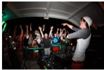
MEETCH TO RELEASE FREE EDM ALBUM WITH A UNIQUE FLAVOR APRIL 27