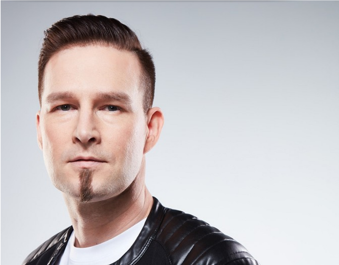
es the "Sandstorm" memes but is still coming out with new music.