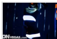
Get Down to Glow