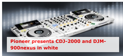
Pioneer presents CDJ-2000 and DJM-900nexus in white