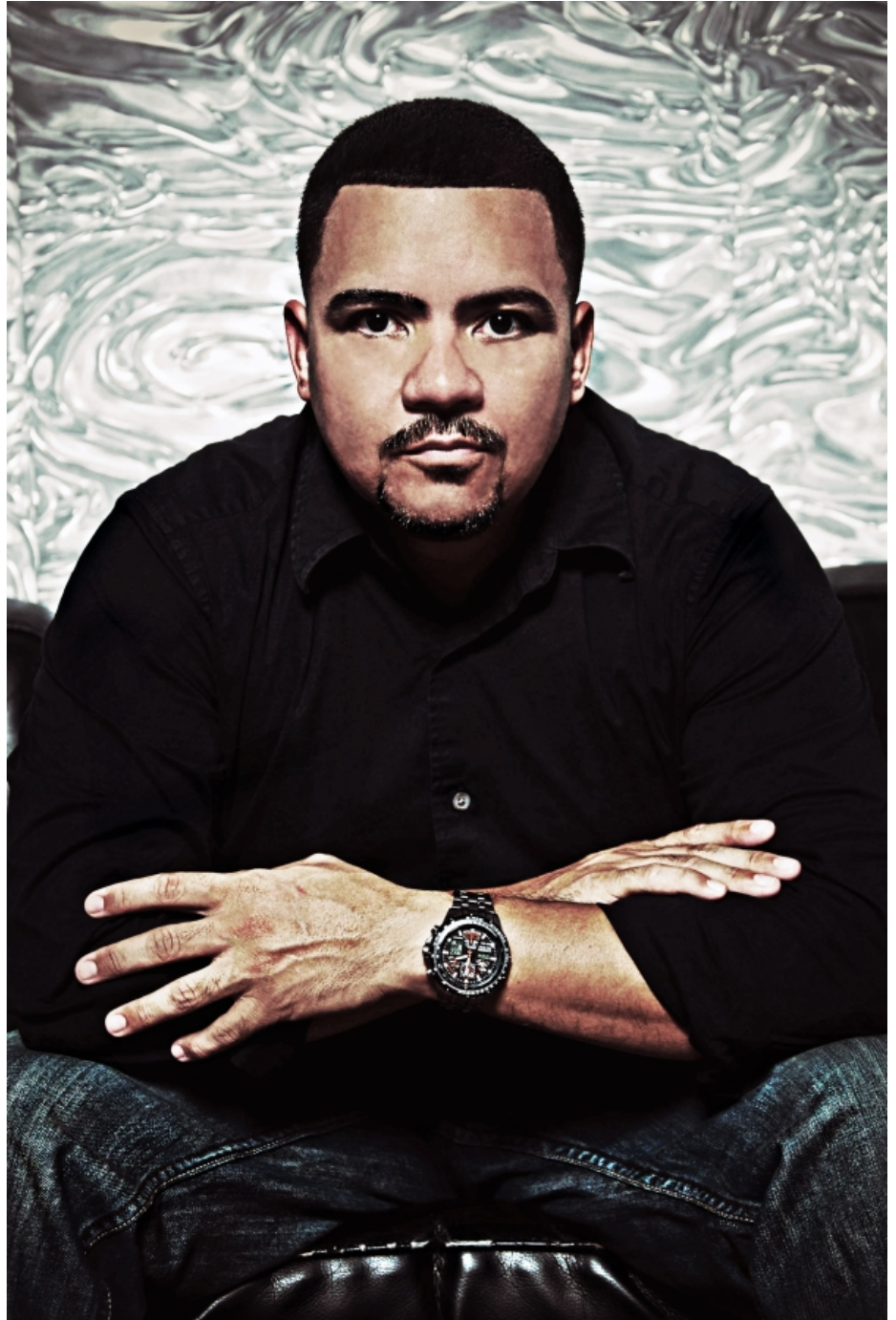
George Acosta – Credit: Black Hole Recordings