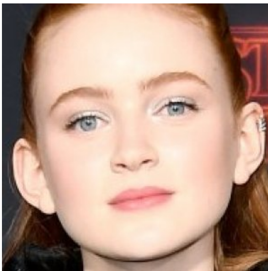
THE UNTOLD TRUTH OF THIS 'STRANGER THINGS' ACTOR