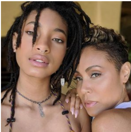
WILLOW SMITH'S TRANSFORMATION IS TURNING HEADS