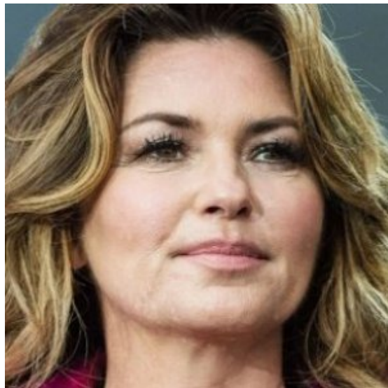
SHANIA TWAIN'S LIFE JUST KEEPS GETTING SADDER AND SADDER