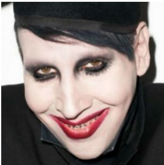
THE GROSS REASON WHY NOBODY WANTS TO TOUR WITH MARILYN MANSON