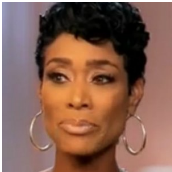
DISTURBING DETAILS HAVE COME OUT ABOUT TAMI ROMAN'S PAST